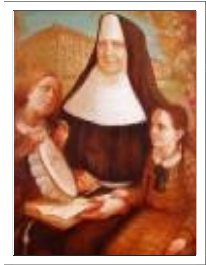
MOUNT ASSISI ACADEMY MARGARETAN PROGRAM